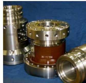
SURFACE WELLHEAD CONTROL