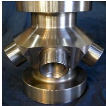
THREADED FLOW CONTROL