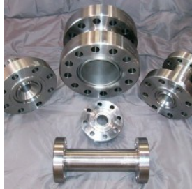
SPOOLS, SPOOL ADAPTERS