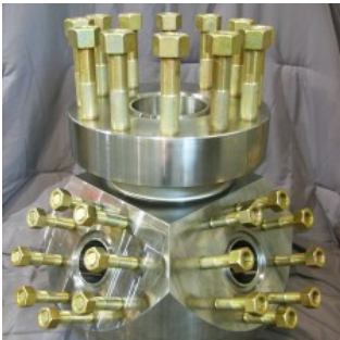
FLANGE FLOW CONTROL