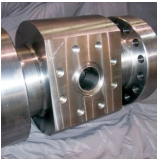
DOUBLE STUDDED ADAPTERS